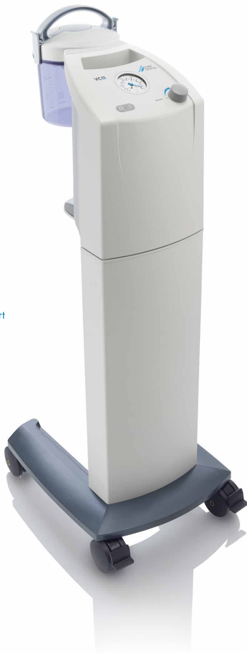
VC 45 with optional Cart for mobile use

When it comes to oral and maxillofacial surgery: Here large quantities of blood, tissue, dentine and bone residues have to be completely removed with the surgical cannula during the operation, necessitating a higher vacuum. Furthermore, the separation of these substances must not lead to any problems. The VC 45 with its powerful, sturdy diaphragm pump and reliable tank system satisfies exactly these requirements for a continuous, fault-free function during the operation.